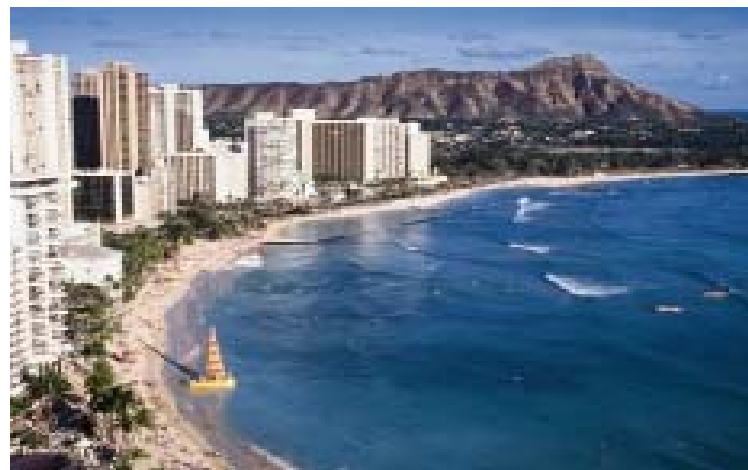
Waikiki Beach, with Diamond Head in the background

If you fancy a month's holiday in Hawaii, for example, the following may be tempting: "We have a newly renovated 2,400 sq foot home on the marina in Hawaii Kai (Honolulu). There are many good restaurants and a couple of small shopping centres within 1 mile, as well as a 24 hour fitness centre. A kayak is available for use. Large pool...etc." As we said, the world is your oyster.